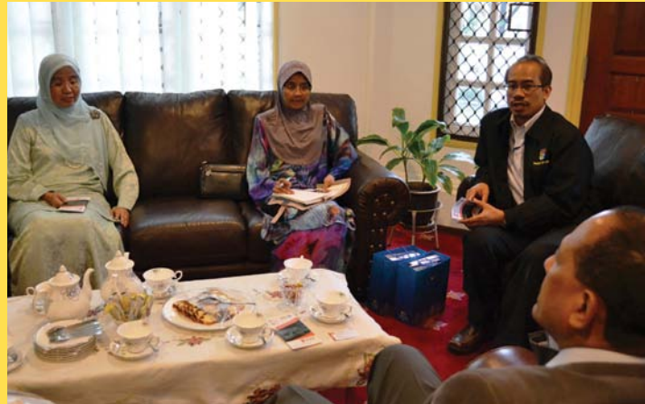
Visit from UNIVERSITI KEBANGSAAN MALAYSIA

KLRCA welcomes visits from various organisations from within and outside Malaysia, which is indeed a great platform to exchange knowledge and forge stronger ties.