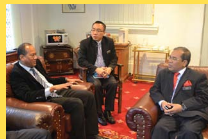
Visit from THE DIRECTOR-GENERAL, LEGAL AFFAIRS DIVISION, PRIME MINISTER'S DEPARTMENT