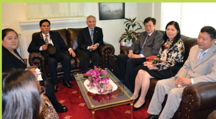
Visit from SHANGHAI ARBITRATION COMMISSION