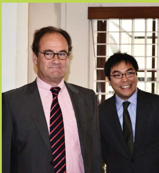
Visit from SECRETARY-GENERAL OF THE PERMANENT COURT OF ARBITRATION (PCA)